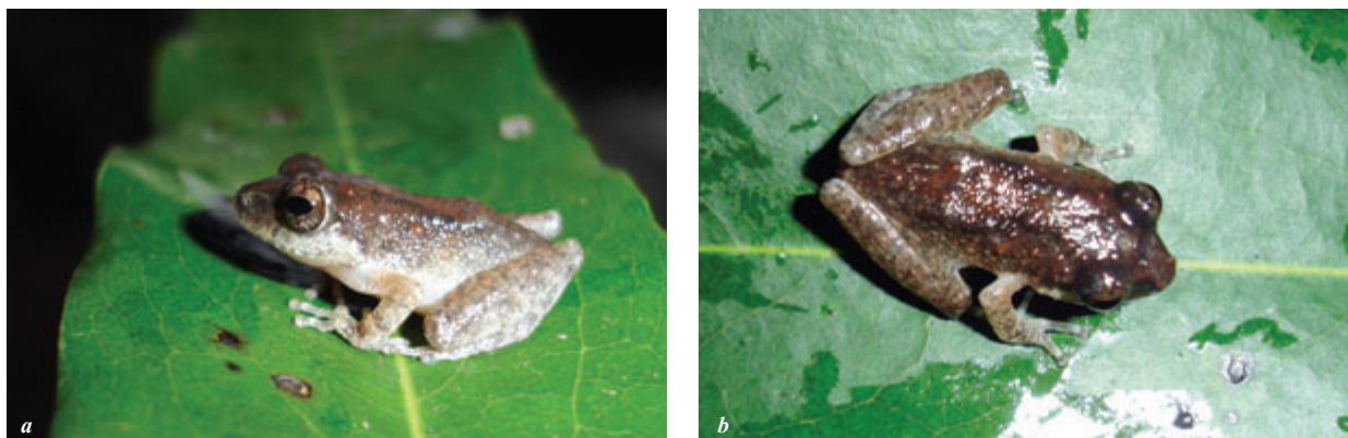
Fig. 1. Philautus regius . a , Mature male (lateral view), Nilgala forest in Sri Lanka (not collected); b , regius . Mature female (dorsal view), Nilgala forest in Sri Lanka (not collected).