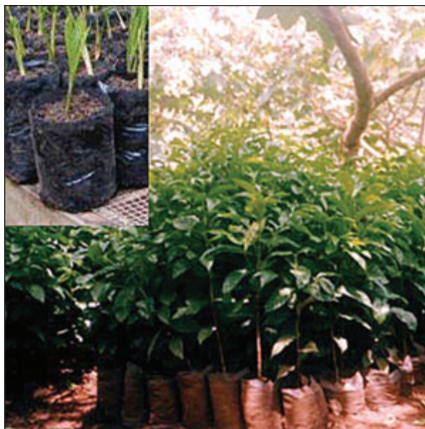
Fig. 2. The plastic bags where the plants have been grown in the nursery.

dial calipers and to the nearest 01 mm with measuring tapes after observing. After taking all the measurements frogs were released. After taking out all the eggs they were measured. After that all the eggs were kept the same place. Headlights were used at night (red color light).