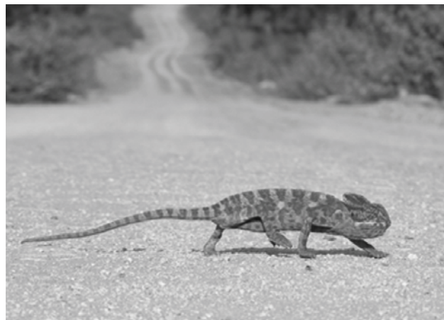
Fig. 05: C. zeylanicus crosses the gravel road

One adult female specimen of Chameleo zeylanicus was detected while it was crossing a 3 m wide gravel road (fig. 5).