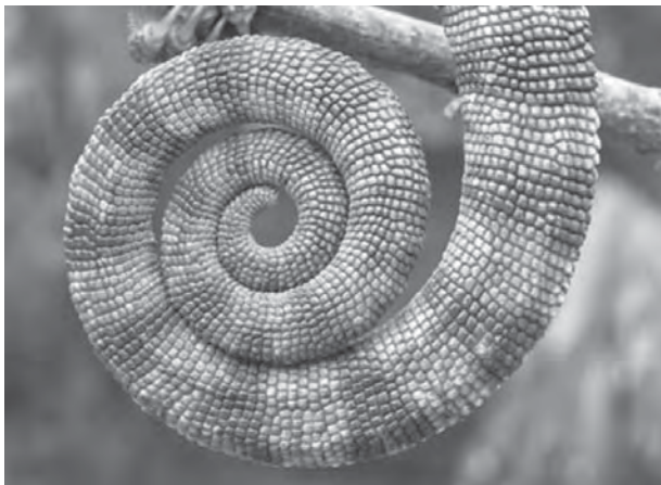
Fig. 03: The prehensile tail of C. zeylanicus

1953; Pethiyagoda, 1997 ; Smith, 1935). The chameleon has large eyes covered by thick granular lids, except for the small transverse slit of the pupil. It can move its eyes independently and they have a greater range of movement than the eyes of other lizards (Deraniyagala, 1953; Wisumperuma, 2001). In Sri Lanka, a fully-grown chameleon may be >375 mm in total length. Generally an adult female chameleon lays about 10 – 31 eggs (Halliday & Adler, 2002; Singh et al. , 1984). The eggs are elliptical and soft shelled. They are white in colour, about 15 – 22 mm in total length and 9 – 12 mm in breadth (Deraniyagala, 1953; Whitaker, 1978). In this paper we discuss some observations related to their ecology, behavior, current distribution patterns and conservation, based on the north-western population of Sri Lanka