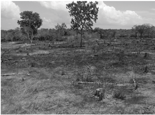
Fig. 06: The original habitats of C. zeylanicus are destroyed by man made fire.

Their habitats are also subjected to deforestation by illegal timber logging. In several areas human settlements have invaded and encroached on the forest. Therefore, domestic predators such as dogs and cats also hunt the edges of the forest. This may increase the predatory pressure on these slow moving lizards. Unplanned agricultural practices also destroy their habitats e.g. chena cultivation leads to the decimation of large forest areas. Among other threats, these slow moving lizards are also subjected to roads kills. In addition, they are also deliberately killed by people in the area due to mythical beliefs related to this species. Their cries are believed to indicate the death of a villager and they are considered as the ‘ghosts’ of pregnant women who died during pregnancy. They are believed to fear women and but for men they are taboo and are creatures to avoid (Somaweera & Somaweera, 2009).