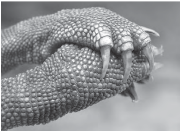
Fig. 04: Opposable claws of C. zeylanicus