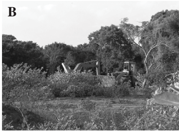
Fig. 07: The large private lands clearing in (A) Wanata-Villuwa forest area for the coconut cultivation and (B) in Thirikka-pallama area.

Therefore, the forest cover has decreased at an alarming rate. In addition, large extents of mangrove forest areas and adjacent scrub areas have been cleared for prawn farms. According to published records (Das & de Silva, 2005; Deraniyagala, 1953; Karunarathna et al. , 2005; Wisumperuma, 2001), the area from Puttalam to Wanatha-Villuwa has the highest abundance of this species. However if these unplanned development projects continue, its habitat will be further reduced. In addition there are many myths surrounding this species among the villagers. According to a survey interviewing the villagers in these areas carried out by the authors, 90% of the villagers who accepted mythical beliefs have not even seen this species. In addition no proper studies on their ecology or distribution have been done before. At present no awareness programs are being conducted in these areas.