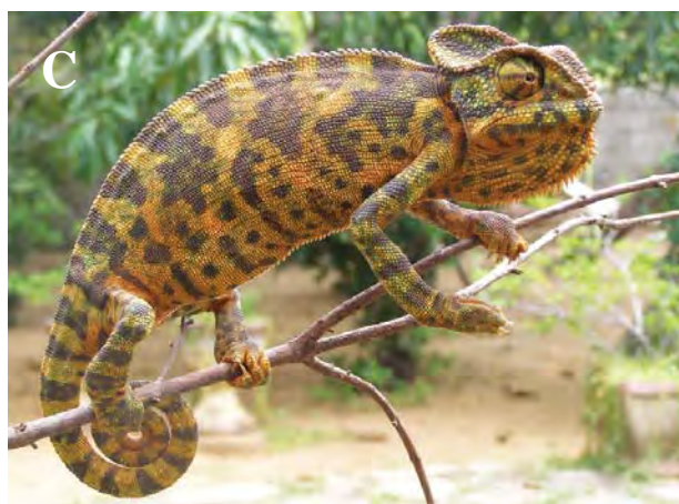
Fig. 02A,B&C: Body colour differences of C. zeylanicus

C. zeylanicus clings to the branches of trees and bushes with the help of its prehensile tail (fig. 3) and opposable claws (fig. 4) (Acharya, 1933; Gaur, 2004).