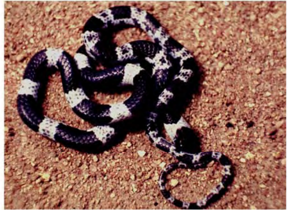
Fig. 12: Dryocalamus nympha