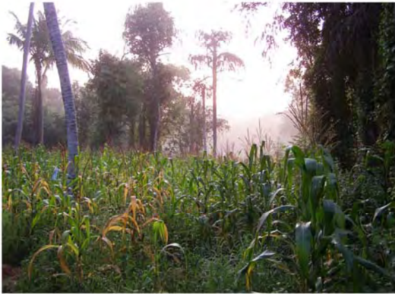
Fig. 03: Chena cultivations