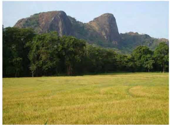
Fig. 04: Paddy fields