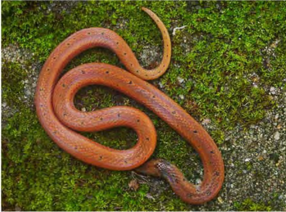
Fig. 11: Aspidura brachyorrhos