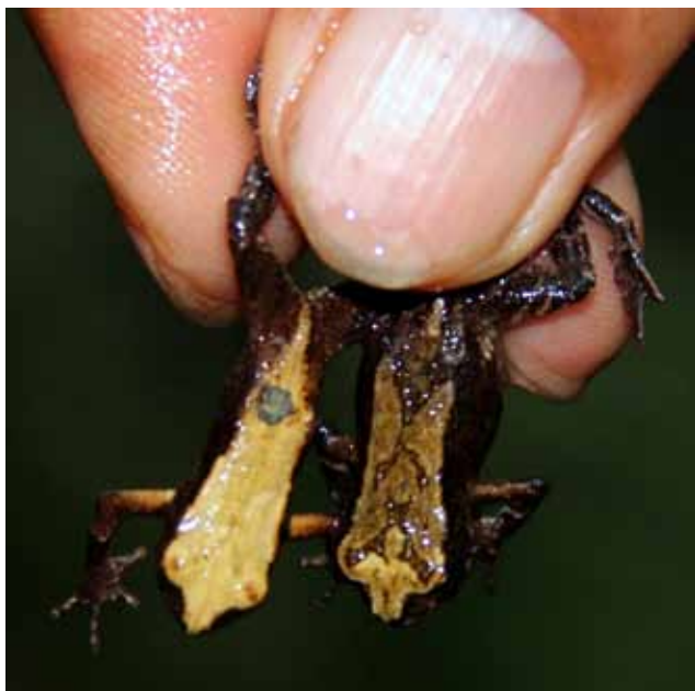
FIG.6. Two types of color patterns of Adenomus dasi photographed from lower part of the Pidurutalagala Forest Reserve.

Dos tipos de patrón de color en Adenomus dasi fotografiados en la parte inferior de la Reserva Forestal Pidurutalagala.