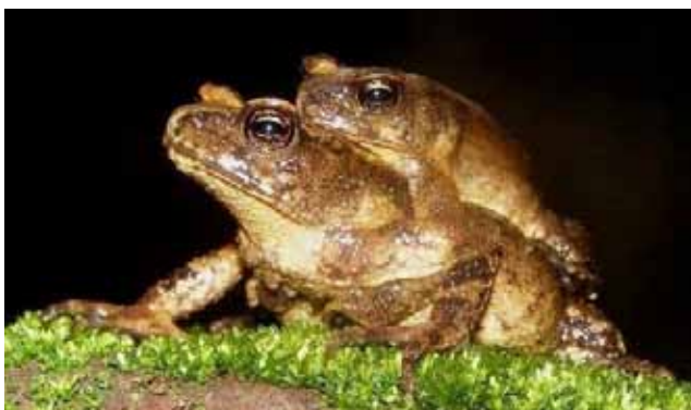
FIG. 3. First ever photographic record of Adenomus kandianus in axillary amplexus (natural) on top of moss covered rock boulder in lower Pidurutalagala Forest Reserve.

Parotid glands rather elongated, narrow (mid-area wider), smooth and divided into four bulges anteriorly (PGW = 20.9% of PGL; PGL = 78.6% of HL; PGL = 80.6% of HW) but somewhat equal in size to back-of-eyes length (PGL = 100.6% of DBE; PGL = 96.9% of LAL), unlobulated, the anterior half elevated in lateral aspect, anteriorly confluent with upper eyelid. Interorbital flat and smooth, but rarely quite small 3–4 rectangle shape granules present. Upper eyelids convex, its outer edge acute, its width more than inter-orbital width and eye-to-nostril distance (UEW = 106.2% of IO; UEW = 101.6% of EN). Anterior end of mandible with a quite large symphyseal tubercle. Lower arm much shorter than head and palm length (LAL = 81.1% of HL; LAL = 88.2% of PAL; LAL = 26.7% of SVL), but longer than snout, parotid gland and upper arm length (LAL = 188.2% of ES; LAL = 103.2% of PGL; LAL = 115.0% of UAW). Both upper and lower arms covered with sharp and rough small warts on dorsal aspect.