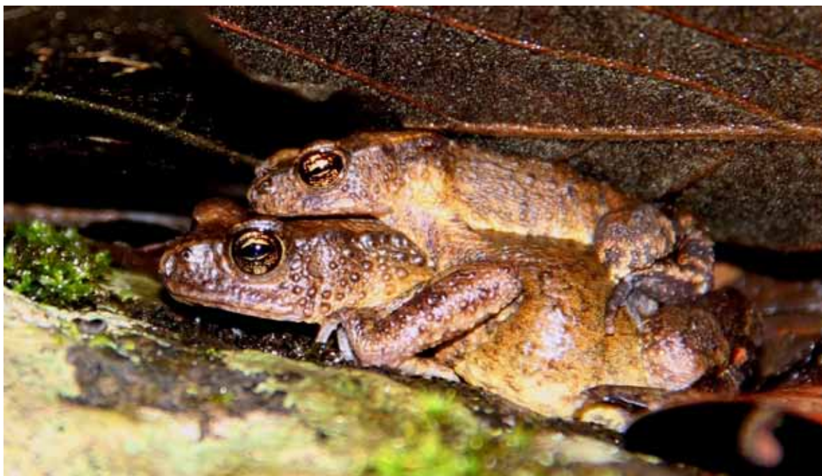
FIG.4. Another Adenomus kandianus in axillary amplexus (natural) hiding on top of moss-covered rock boulder (covered with wet leaf litters) in the lower part of the Pidurutalagala Forest Reserve by daytime.

Otro Adenomus kandianus en amplexo axilar (natural) escondido en la parte superior de una roca cubierta de musgo (cubierto con camadas de hojas húmedas) en la parte baja de la Reserva Forestal Pidurutalagala, de día.