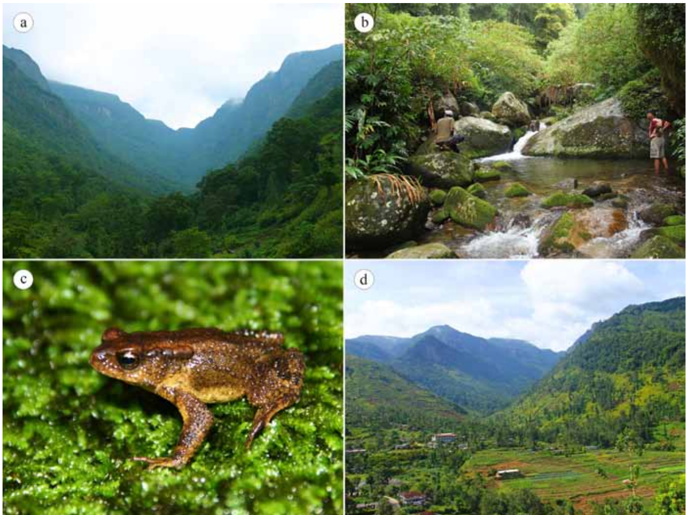
FIG.5. (a) Undisturbed forest area in the gully of lower Pidurutalagala forest reserve; (b) typical habitat of the toad Adenomus kandianus with a rapid flowing stream and rock boulders; (c) a male A. kandianus on its microhabitat in middle of the stream; (d) lower part of the forest (PFR) with high anthropogenic pressure.

(a) Área de bosque no perturbado en el barranco de parte baja de la Reserva Forestal Pidurutalagala; (b) el hábitat típico del sapo Adenomus kandianus con una corriente de cauce rápido y cantos rodados; (c) un A. kandianus macho en su microhábitat en medio de la corriente; (d) parte inferior del bosque (PFR) con alta presión antropogénica.