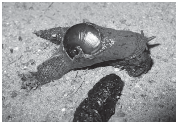
Fig. 02: R. irradians on the scats of Jackal

This is the first observation of E. carinata feeding on a land snail R. irradians . Further investigation is needed to establish if R. irradians is a regular item of the diet of E. carinata and to clarify what R. irradians feeds when on Jackal scats. Data on the diet and feeding habits of Sri Lankan and South Asian land snails or skinks are sparse and further observations are needed to verify their feeding habits. It is interesting to examine food and feeding habits of E. carinata on its range especially in